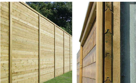
Example image of acoustic fence