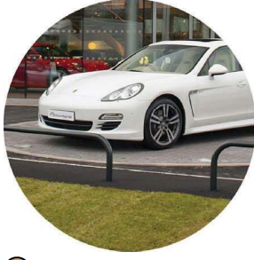
3 Hooped perimeter barrier