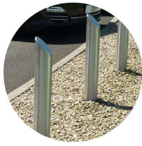
2 Protection bollards