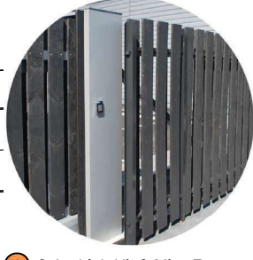
4 2.4m high Hit & Miss Fence