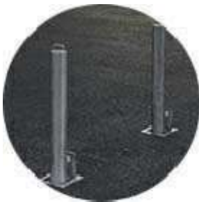
1 Retractable bollards