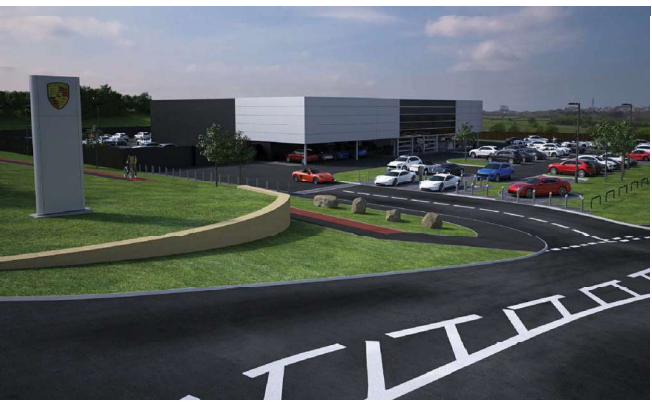
View to site entrance

Scheme proposal prepared on developer plot information. A detail site survey is recommended prior to development of detail design.